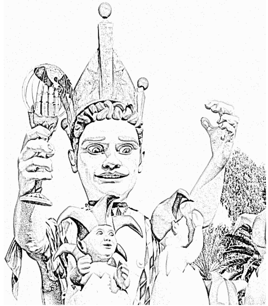
Lou rèi dou Carnaval