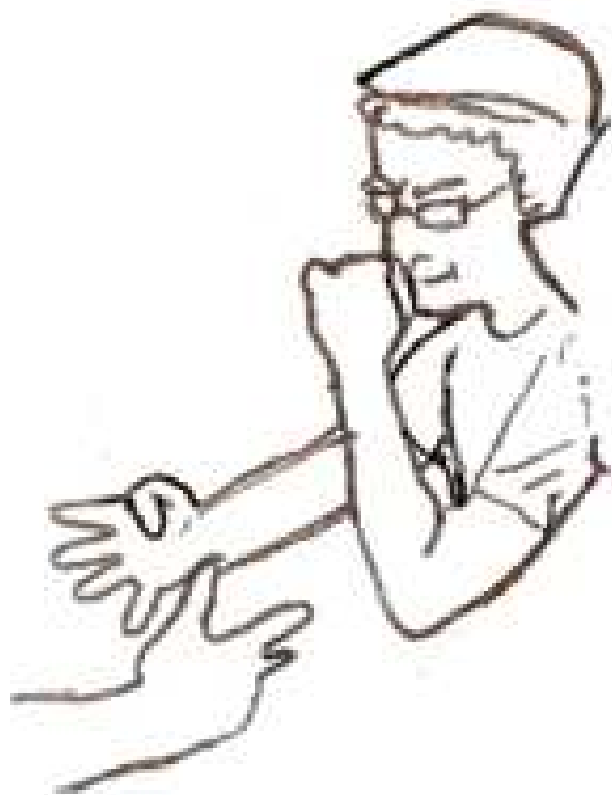
Lou jugaire de mourra