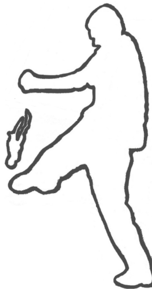
Lou jugaire de pilou