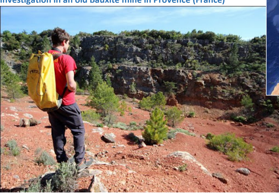
Figure 1: Your field investigation area!. Aluminium ore was identified in 1821 in the South of France and named Bauxite after the village where it was discovered.

Investigation in an old Bauxite mine in Provence (France)